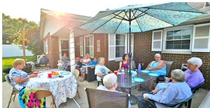
The entire group minus our hostess above.